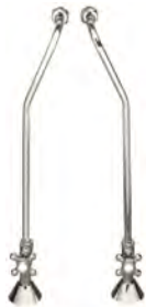
Water Supply Tubes