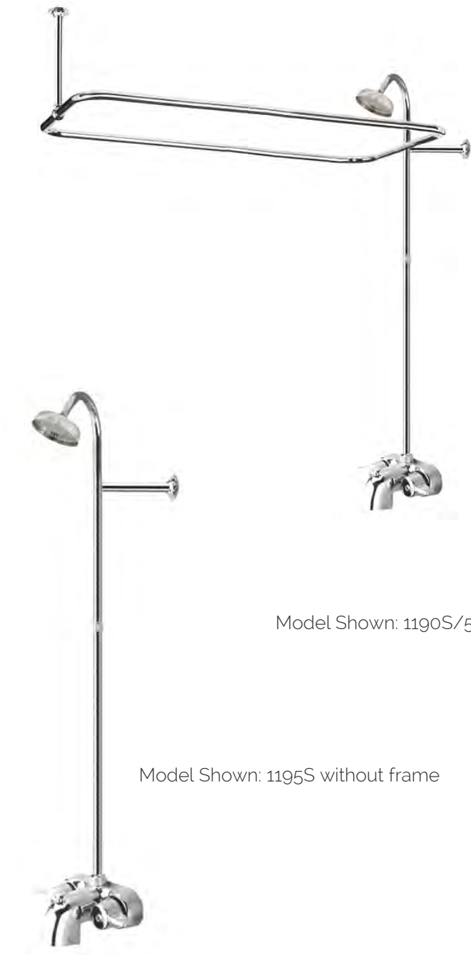
Model Shown: 1190S/54