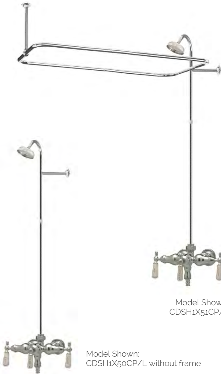
Model Shown: CDSH1X51CP/L

Metal Lever Handles Add suffix /ML at end of model #