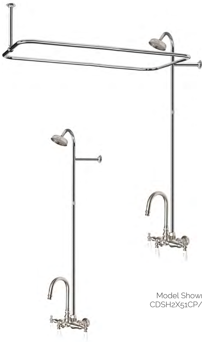
Model Shown: CDSH2X51CP/L