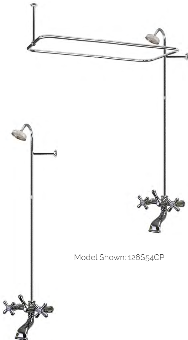
Model Shown: 126S54CP

White Lever Handles Add suffix / L at end of model #