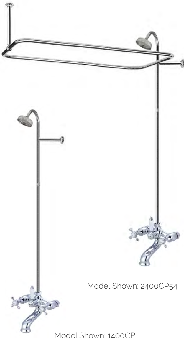
Model Shown: 2400CP54

White Lever Handles Add suffix /L at end of model #