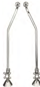
Water Supply Tubes