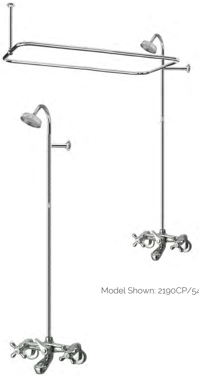
Model Shown: 2190CP/54