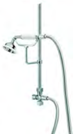
Add-A-Handshower Diverter Kit