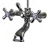
Model Shown: 126RCP without frame