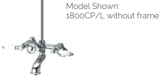
Model Shown: 1800CP/L without frame