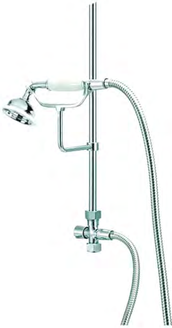
Standard installation as shown on a shower riser tube.